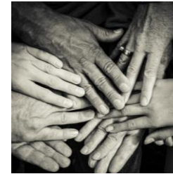
Mental Health Resources