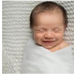
Safer Sleep NM